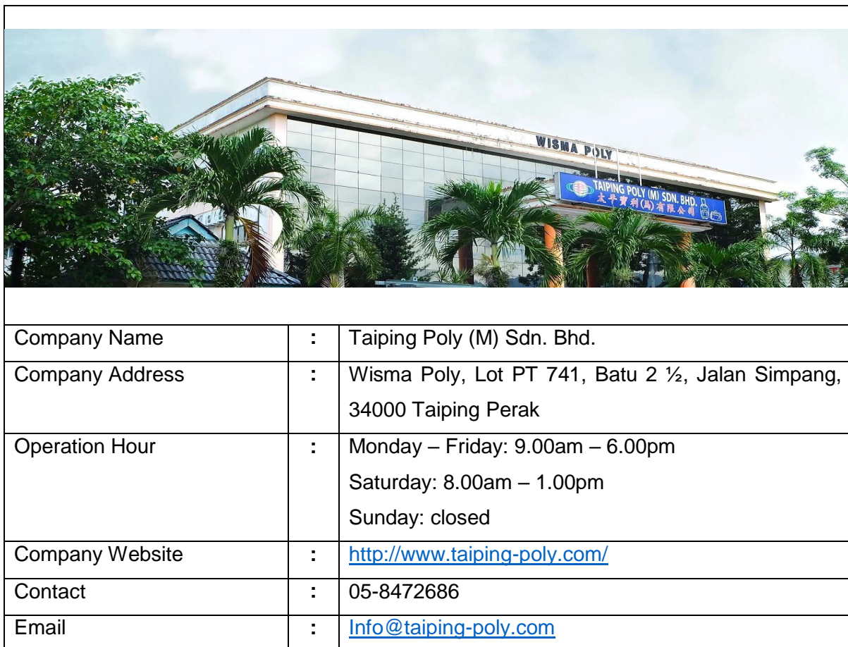
Table 1: Taiping Poly Company Information