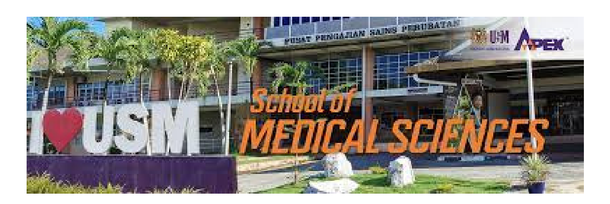
Official picture of School of Medical Sciences (PPSP), USM

The School of Medical Sciences, Universiti Sains Malaysia (USM) was established in 1979, as the 3rd medical school in Malaysia. In 1990, the school which was originally based at the main USM Campus in Penang had been relocated to Kubang Kerian, Kelantan, East Coast of Malaysia where the teaching Hospital USM was built. The School of Medical Sciences, USM strives to be a center of academic excellence, providing medical education and training of the highest standard and being a leader in research and innovation in the field of medical science and technology. Below is the picture of the School of Medical Sciences (PPSP), USM.