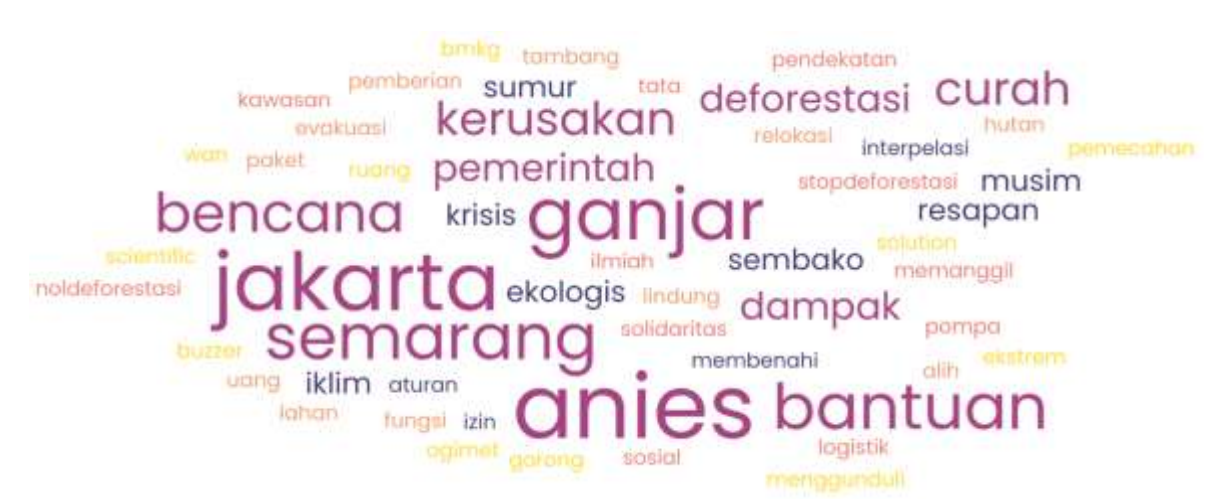
Figure 2: Words Cloud from Most Mentioned Words

This surge of online activity underscores the community's desire for more effective flood management policies and greater transparency from their leaders. It also reflects a broader sentiment of distrust and dissatisfaction with how urban flooding issues are handled, prompting calls for more robust and preventative measures to mitigate future flooding risks. The widespread use of social media thus serves as a powerful tool for holding the government accountable and advocating for better urban flood management practices.