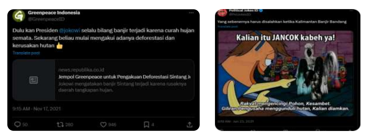
Figure 3. Example of X Post regarding the Severe Floods in West Borneo

clear regulations and the frequent violations of existing rules. This discourse highlights several critical points that illustrate the systemic governance challenges in flood management.