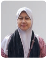
International : Puan Syazliyati Ibrahim

Echoes from the Heart: A Poetic Tribute to Palestine