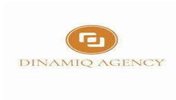
Figure 1: Dinamiq Agency Logo