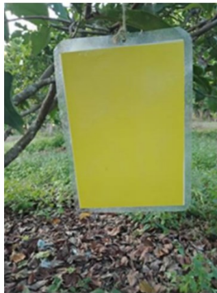
Figure 2. The laminated sticky trap sprayed with sticky glue (IAT Spay Brand) was hung under a canopy.