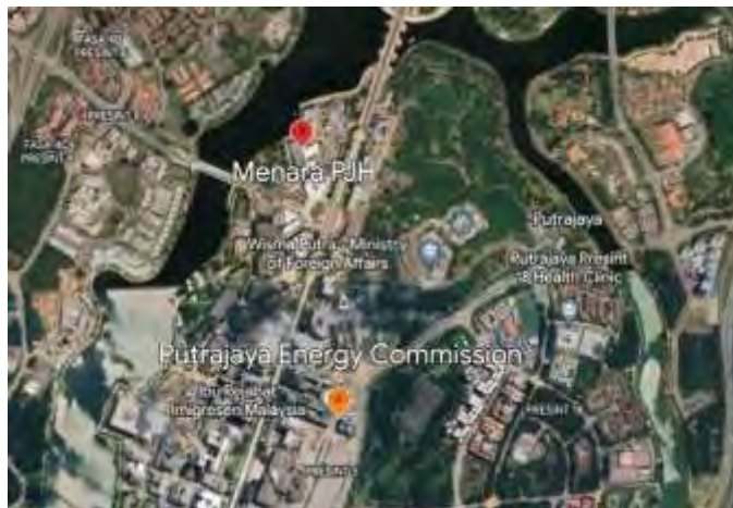
Figure 1: Location of selected case study

collected data was meticulously transcribed and subjected to thematic analysis to identify recurring patterns, challenges, and successful practices. These themes were then organized into a coherent framework, which served as the foundation for deriving implications and recommendations for the green building industry in Putrajaya. However, this research relies on self-reported data provided by property managers, which may introduce certain limitations. Property managers' responses may be influenced by their personal experiences, perceptions, or a desire to present themselves in a favorable light, potentially impacting the accuracy and reliability of the data collected.