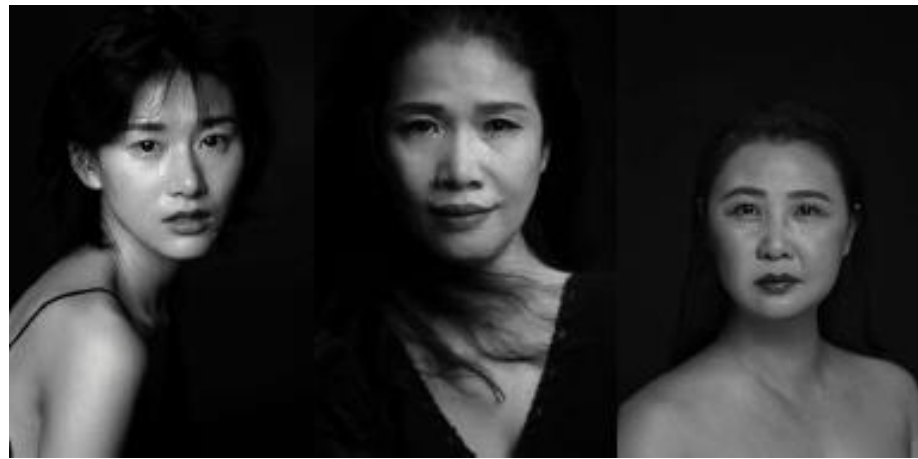
Figure 3 Facial Expression (Sadness)