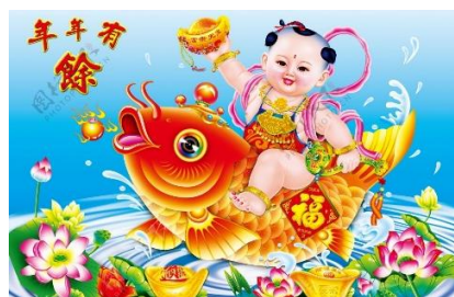
Figure 2 Fish in folk culture