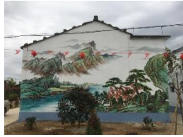
Figure 12 Rural regions of China

venues, offer opportunities for the growth and promotion of folk art. In rural regions of China, wall painting has been employed as a means of embellishing the local environment (Figure 12). Similarly, in certain hotels, proprietors opt for wall painting as a means of achieving a distinct decorative effect, deviating from the conventional style. Furthermore, wall painting is also selected as a decorative element in shopping malls (Figure 13), to enhance the overall ambience of the space. Simultaneously, certain modest public establishments, such as hotels (Figure 14) and schools (Figure 15), will also allocate designated areas to accommodate folk art in the form of wall paintings.