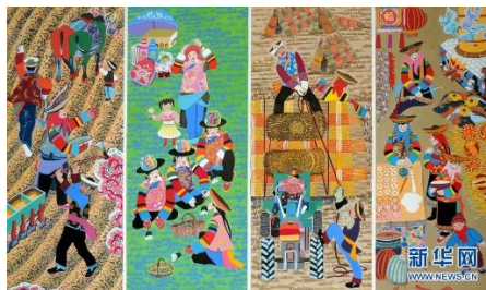
Figure 6 Farmer painting

The political standing of farmers has experienced significant transformations in the emerging society. Farmers who have undergone cultural education demonstrate a newfound inclination towards artistic expression, particularly through the medium of painting. They actively engage in the process of modelling and creation, guided by their aesthetic sensibilities. By preserving the inherent qualities of farmers, they effectively depict rural life through a distinctive artistic vocabulary. This particular genre of emotive artwork can resonate deeply with the viewers (Figure 6).