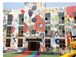
Figure 15 Schools