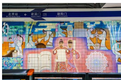
Figure 10 Four Great Inventions

The increasing popularity of wall painting, as documented by The Times, has led to its emergence in a novel form, thereby charting a fresh trajectory for the advancement of folk art. Individuals opt for the artistic medium of mural painting, wherein there exists no imposed limitation on its thematic content, thereby affording a conducive environment for the expression and preservation of folk art (Asif & Ali, 2019). The primary target demographic for wall paintings in tube stations is the general populace, and the physical setting in which they are situated is also a communal environment, necessitating a substantial quantity of wall paintings inspired by folk art. The wall painting titled "Four Great Inventions" (Figure 10) at Jianguomen Station of Beijing Metro Line 2 primarily portrays the four significant innovations of ancient China, namely paper, printing, gunpowder, and compass. Similarly, the painting "Huaxia Xiongfeng"(Figure 11) on the wall of Dongshix Station of Beijing Metro predominantly illustrates the depictions of Chinese historical figures engaging in the practice of martial arts.