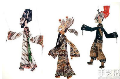
Figure 4 Folk shadow play