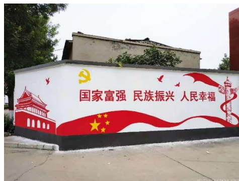
Figure 9 Slogan

A slogan (Figure 9) refers to a concise textual expression commonly used in propaganda. Slogans possess not only the attributes of precise and succinct official document style but also exhibit the qualities of stringent and stimulating political discourse style (Chu, 2000). These entities possess the ability to stimulate individuals intellectually and evoke emotional responses. To promote social education, slogans assume a significant role in shaping individuals' social conduct by influencing the dissemination of social public opinion and culture. Moreover, they serve as indicators of the level of social civilization to some extent. The slogan represents the prevailing mode of expression within rural wall painting art, characterised by its simplicity, clarity, and accessibility. The dissemination of crucial information within a nation is frequently facilitated by its active involvement.