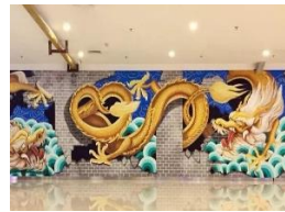
Figure 13 Shopping malls