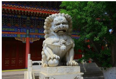
Figure 1 Stone lion

The analysis of the modelling components in folk art reveals that the dragon and phoenix symbolise the equilibrium between Yin and Yang within the celestial and terrestrial realms. Stone lions (Figure 1) are commonly referred to as sacred creatures, traditionally employed to safeguard residential structures. The term "Peony" carries connotations of prosperity and prestige, while the symbol of the "Lotus" represents purity. The lotus flower exhibits a close association with narratives within the Buddhist tradition, thereby suggesting the existence of a metaphysical domain that transcends the ordinary realm of existence. The depiction of fish symbolises the bountiful yield of agricultural produce, and traditional art forms have historically profoundly conveyed this representation of fish (Figure 2). Furthermore, cattle, sheep, magpies, and cranes serve as prominent folk totem symbols, frequently depicted in various forms of artistic expression.