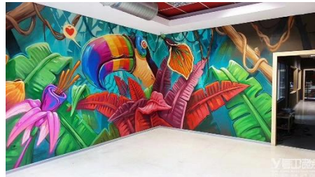
Figure 8 Caricature

humour, often employing both direct and indirect means of communication. The primary distinction between this particular artwork and others resides in its distinctive approach to conception and expression, its artistic attributes of irony and humour, and its societal functions about cognition, education, and aesthetics (Roslan & Bakar, 2019). The incorporation of this painting style into the realm of wall painting art (Figure 8) can be attributed to its popularity among rural communities, who have developed a deep affection for comics. This inclusion serves to enhance the overall appeal and pleasure derived from the artworks.