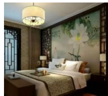
Figure 14 Hotels