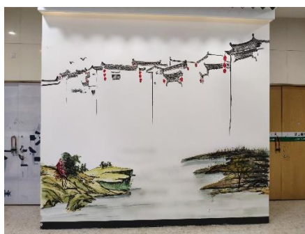
Figure 7 Chinese ink painting

Chinese painting, alternatively referred to as ink painting (Figure 7), is widely recognised as a prominent artistic medium. Chinese painting encompasses the cognitive and interpretive perspectives of ancient individuals towards nature, society, and their corresponding political, cultural, religious, moral, and philosophical dimensions, thereby serving as a vessel for content and artistic expression. Chinese painting can be categorised into three distinct genres: figure painting, landscape painting, and the integration of man and nature. Figure painting captures the intricate dynamics between individuals and society, as well as the interplay among individuals themselves. On the other hand, landscape painting delves into the profound connection between humanity and the natural world, seamlessly blending the two entities. Flower-and-bird paintings exemplify the symbiotic relationship between various forms of life and human beings within the natural environment, thereby illustrating a state of harmonious coexistence. The incorporation of Chinese painting techniques into cultural wall painting aims to facilitate the public's gradual assimilation of social concepts such as reverence for the elderly and compassion for the young, fostering good neighbourly relations, environmental stewardship, and the promotion of harmonious cohabitation between humanity and the natural world (Tringham & Rickerby, 2020).