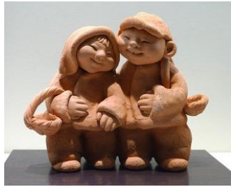
Figure 5 Folk clay sculpture