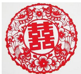
Figure 3 Paper-cutting

Various forms of artistic expression, including paper cutting, clay sculpture, embroidery, cloth paste, batik, and others, offer diverse ways to convey the same subject matter and shape. These different mediums employ distinct processes, resulting in varied aesthetic experiences and enhancing the visual representation of folk art (X. Zhang & Wang, 2022). For instance, one notable example is the traditional art form of folk paper-cutting, which employs symbolic expression techniques characterised by concise shapes and slightly exaggerated elements, often incorporating hollow shapes. This text discusses three forms of traditional folk art: 1) The symbolic representation of good wishes in marriage and harvest by Paper-cutting (Figure 3), 2) The art of folk shadow play (Figure 4), which initially employed paper and later transitioned to animal skins such as donkey, cow, and sheep, utilising decorative modelling language to convey the emotions of joy and sorrow within the human realm, and 3) The art of folk clay sculpture (Figure 5), where skilled artisans and artists employ natural colours and employ exaggerated and dynamic techniques to depict narrative-rich imagery.