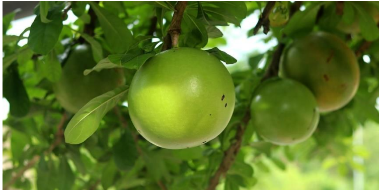
Fig. 1 Maja fruit.

The scarcity and difficulty that farmers experienced in obtaining synthetic fertilisers for their rice crops 1 , coupled with the high cost of fertilisers, allowed for the exploration of alternative local resources that could be used as fertiliser, one of which was the maja fruit 2 . Maja fruit ( Aegle marmelos ) is an inedible fruit that grows wild as shown in Fig.1. In the village of Sungai Rengas, Kubu Raya Regency, only the peel of the maja fruit is utilised as a container for coconut sap by palm sugar makers, while the inner part is discarded as waste. However, the inner part of the fruit can still be utilised as source material to produce liquid fertiliser.