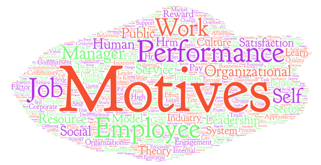
Figure 3: Word Cloud of the Author Keywords