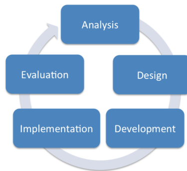
Fig. 2 : ADDIE MODEL