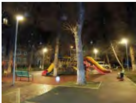
Figure 2: Playground with good luminous of light