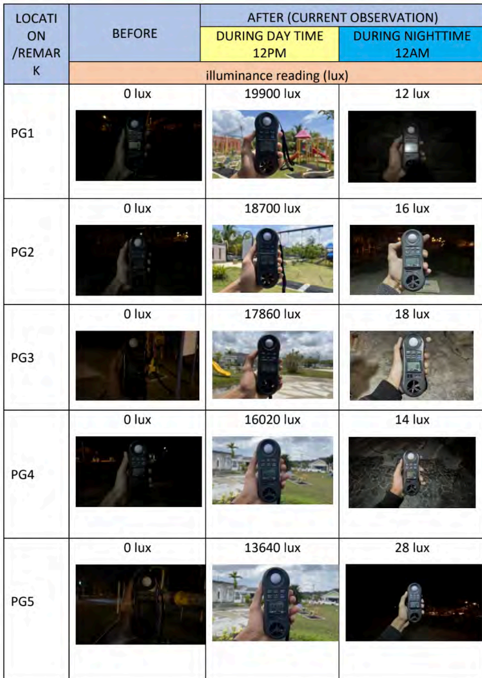
Table 2: Data collection for illuminance by lux meter

For this data analysis stage, 6 types of solar lighting power (watt) have been used, which are 10-watt, 25-watt, 30-watt, 45-watt, 60-watt, and 100-watt. The reason for selecting this type of power is to assess the accurate comparison between the lighting standard and the current lighting condition and to recommend the needed unit of this solar lighting system stated on table 3, table 4, table 5, table 6, table 7 and table 8.