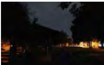
Figure 1: Playground with bad luminous of light

studying various methods and implications of lighting installations (Peña-García et al., 2015). The presence of adequate lighting positively impacts individuals' safety, as insufficient lighting increases the risk of becoming a victim of crime (Maruthaveeran, 2015). Violent crimes are more prevalent during weekends and nighttime hours, particularly between 10 pm and 6 am (IAS, 2020). Studies have shown that improved illumination positively influences people's perceptions of safety (Haans & de Kort, 2012). However, additional research is needed to determine the specific illumination requirements and their impact on safety perceptions (Dastgheib, 2018).