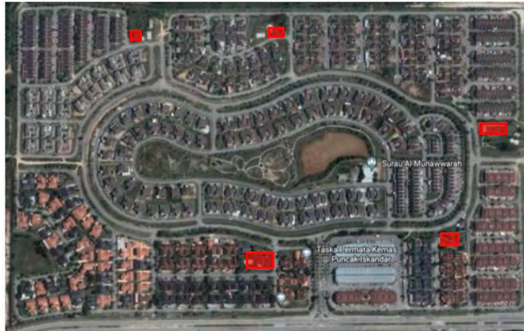
Figure 4: Location of Case Study