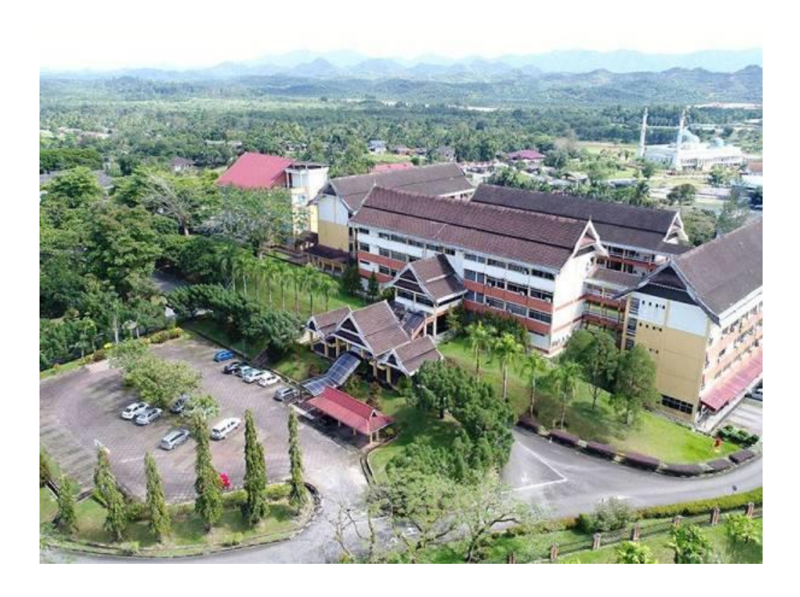
Figure 2.1.1 above shows the main building of Lembaga Kemajuan Terengganu Tengah (KETENGAH).