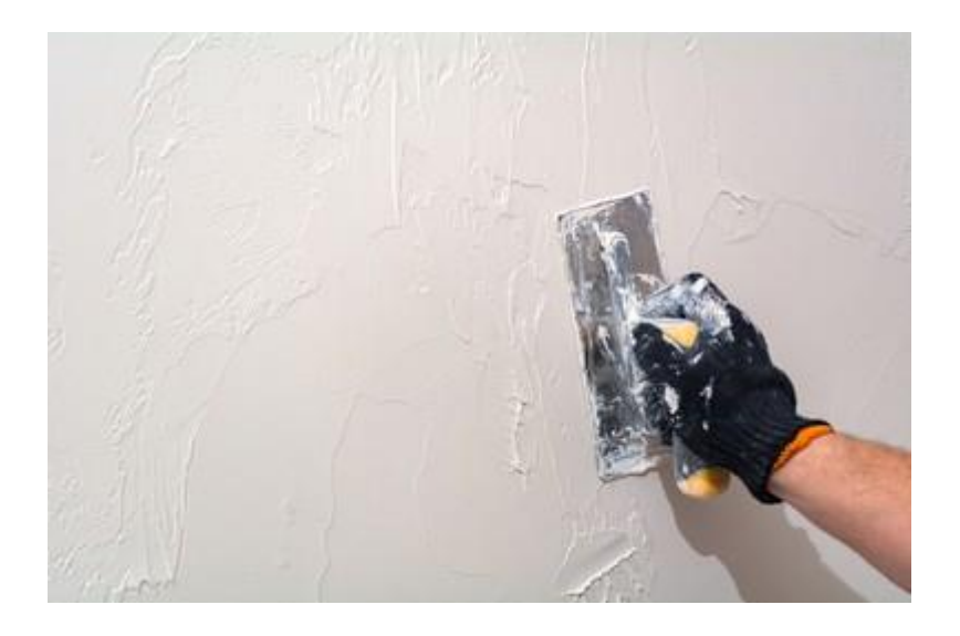
Figure 3.2.1 above shows plastering the wall

The downsides of lime plaster include that it hardens slowly, making plastering more difficult. Aside from that, the wall will not be dry during the unexpected setting period, which will make the laborer's job more difficult. Furthermore, the hydrogen potential, or pH level, will decrease. The pH level is really high.