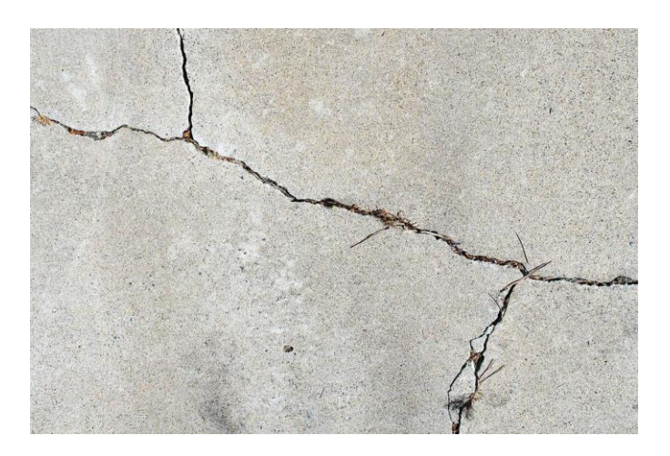
Figure 3.4.1 above shows hairline crack.

Settlement cracks are most common when a house is being renovated. These cracks are characterised by groups of cracks that run in the same direction and should be watched since they are structural fractures that require professional assistance. Large variances in foundation settlement induced by variable soil and loading conditions are likely to generate this sort of crack. The delamination crack indicates that the plaster behind it is moving away from the wall or ceiling stud. There is a risk of the plasterboard falling if these fissures run parallel to both ceilings and walls. As quickly as feasible, these should be repaired or replaced.