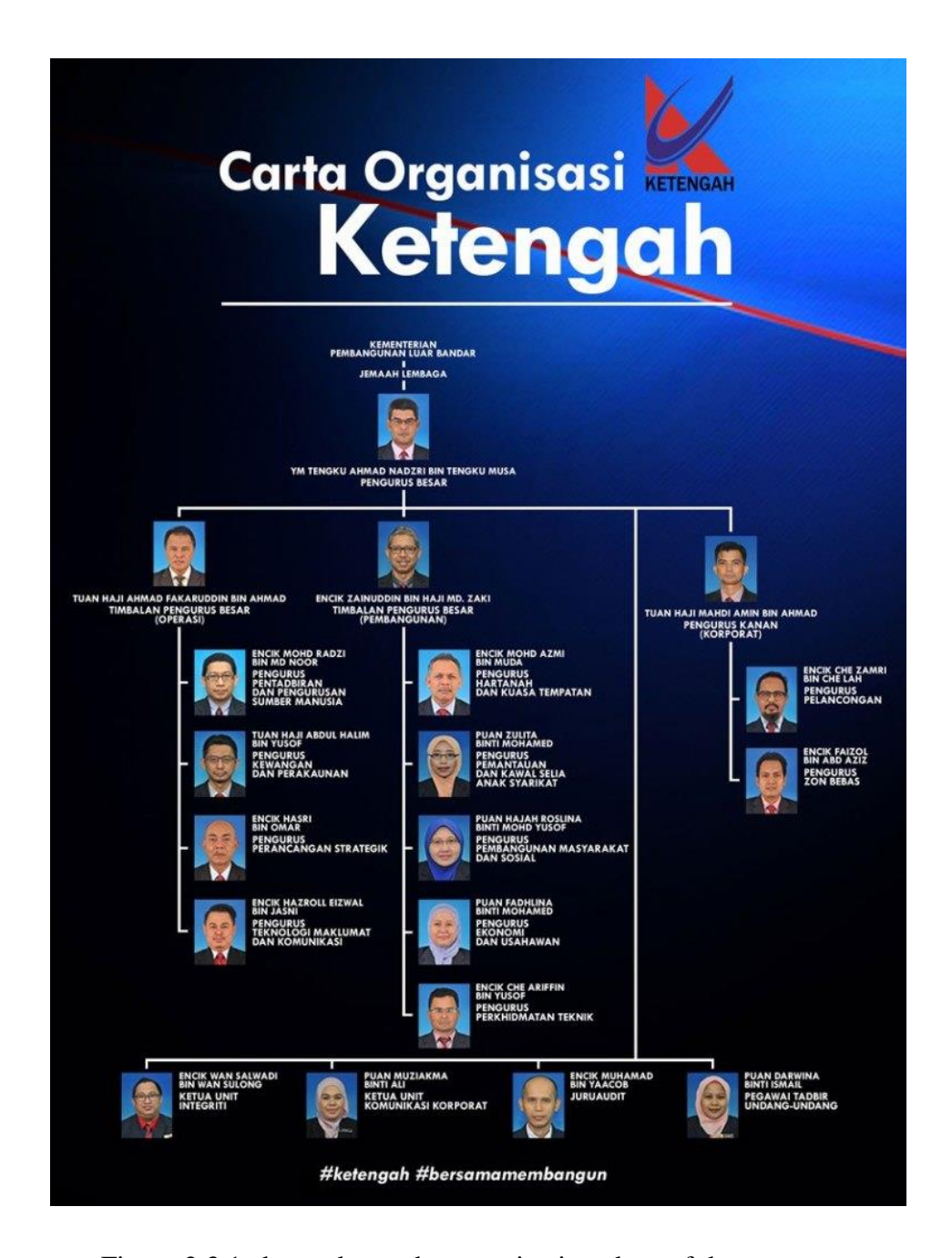
Figure 2.3.1 above shows the organization chart of the company.

Below shows the organization chart of the company starting with the executive chairman to the main head for each departments such as operational, building and corporate.