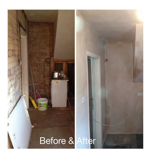
Figure 3.2.2 above shows before and after plastering.

The vertical junction of structural columns / walls & brick walls will be handled by securing 200mm wide mesh to the vertical wall joint using wire nails / concrete nails and aligning the mesh. Joints between walls and beams will be made up to a maximum of 20mm and sealed with a flexible filler that is fire rated for 30 minutes. (Material descriptions will be submitted to the Engineer for approval). Internal plastering will be applied to concrete columns, beams, and walls that are aligned with brick walls, and other concrete surfaces will be coated with cement base simple plaster. (Material descriptions will be submitted for the Engineer's approval.)