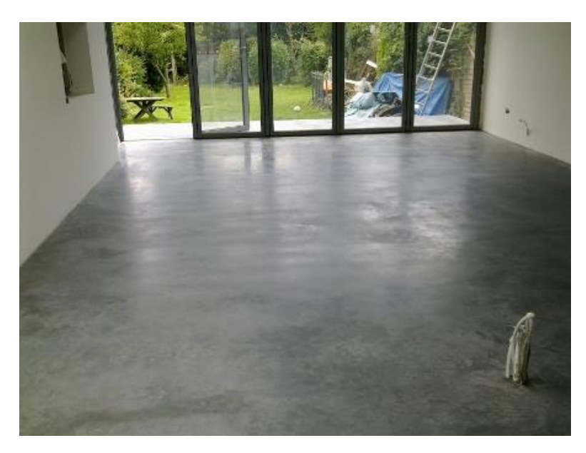
Figure 3.3.2 above shows the concrete floor.

The floor used is concrete floors. Concrete floors have various advantages, including strength, stiffness, span, fire resistance, acoustics, maintenance, and lifespan. A concrete floor consists of a flat slab of concrete that is either poured in place or precast in a factory. Reinforcing steel, often known as rebar, is a steel bar or mesh of steel wires used to reinforce concrete. Rebar is used to compensate for the fact that, while concrete is strong in compression, it is weak in tension. Rebar can carry tensile loads and hence improve overall strength by being placed into concrete.