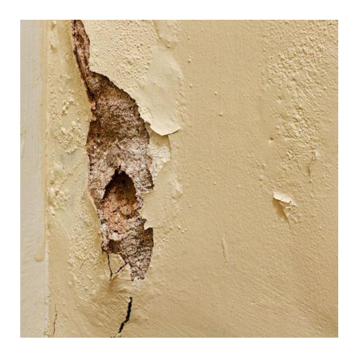
Figure 3.4.3 above shows delamination crack.