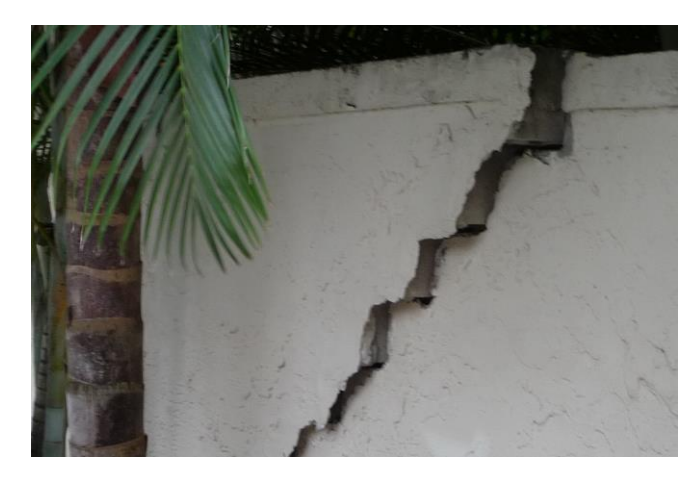
Figure 3.4.2 above shows settlement crack.