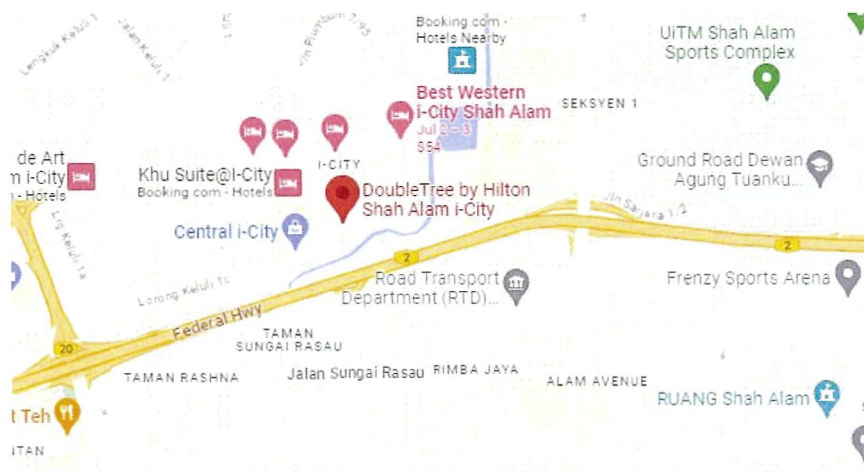
Figure 3: taktahuuu

Address: Finance Avenue, I-City, 40000 Shah Alam, Selangor, Malaysia