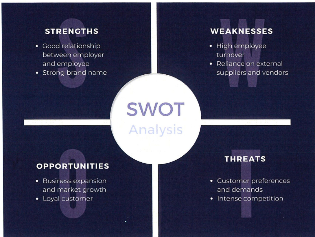
Figure 4: SWOT analysis