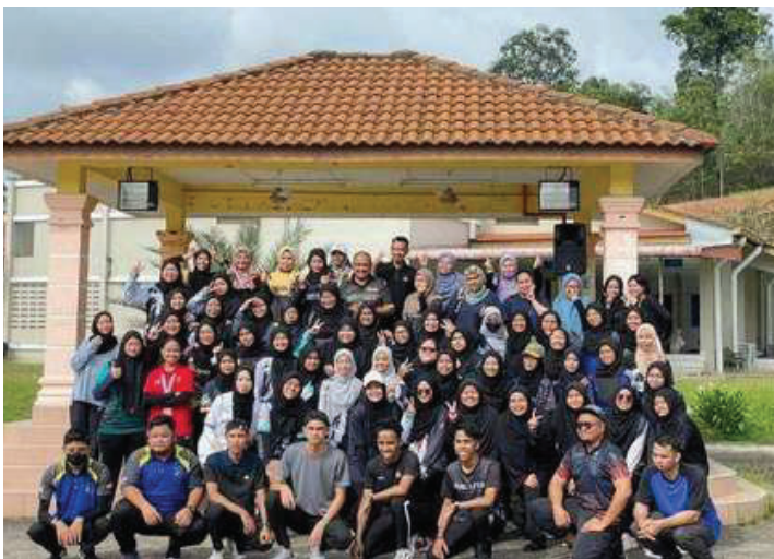
Organiser and participants