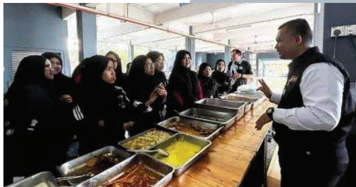
Food Premises Inspection Simulation at CafeteriaAerobikton of UiTM Kuala Pilah Campus by a Health Inspector