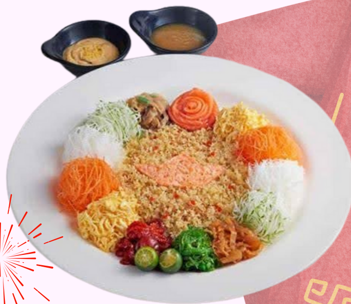
Sushi King Yee Sang