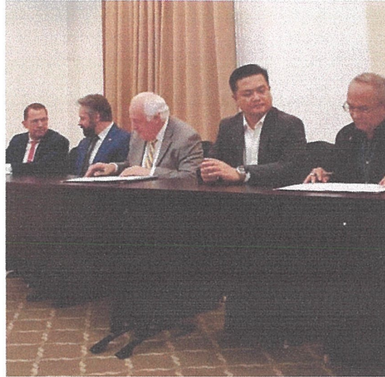
Figure 5: Swiss-Belhotel International Signing Ceremony

the company. The business can successfully handle challenging competition if appropriate and effective solutions are employed. The company also may produce an entirely new service or good, or it may carry on with its current operation.