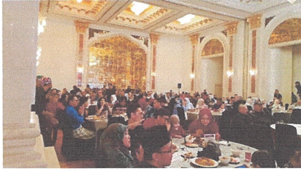
Figure V: IBUC dinner first event management