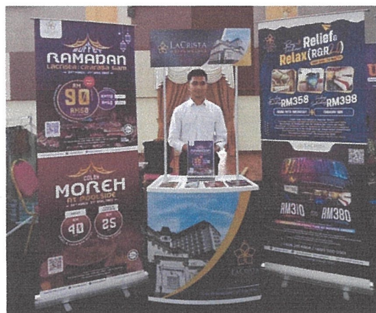
Figure 2: In charge of booth at UiTM Alor Gajah

In collaboration with the UiTM Melaka Branch and the Melaka E-Sports Association (MEA), Novoid Arena E-Sports Hub sponsored the Campus Attack Esports Carnival and introduced Roombox, a place designed by students at UiTM Alor Gajah. The LaCrista Hotel Melaka has participated in the event as one of the sponsors since Novoid Arena is owned by the hotel. Therefore, it was an honour for the hotel to promote its products and services whereby the trainee has been in charge of booth during the event from 9 AM until 5 PM to conduct promotion. The opportunity to host a booth at this event allows audiences to ask follow-up questions or get clarification.