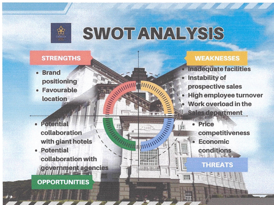
Figure 4: SWOT Analysis of the LaCrista Hotel Melaka

This analysis overall helps in devising a proper plan for the company to stay ahead of the competition in the hotel industry or the hospitality industry. The LaCrista Hotel Melaka should periodically assess the company's procedures in order to manage a profitable business by evaluating if the current strategies and goals still represent the best course of action. Consistent business analysis and strategic planning is the best way to keep track of growth, strengths and weaknesses. Therefore, in this part, the trainee will explain on the strenghts, weaknesses, opportunities, and threats of the LaCrista Hotel Melaka based on his observation during the industrial training.