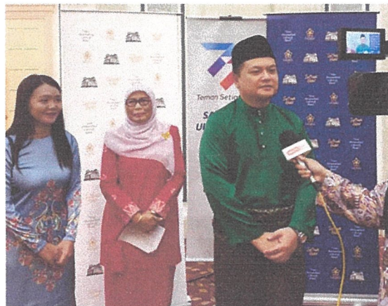
Figure 6: Collaborate with RTM through CSR

As the company is to encourage more collaboration of having a Social Corporate Responsibility (CSR) program, the LaCrista Hotel Melaka may work with local organizations. Some organizations can offer a lot of assistance in putting CSR programmes into action since they have a thorough awareness of the requirements of the community. Despite working with RTM, the company can employ media giants such as Astro and Media Prima to promote marketing excellence and drive business growth. The LaCrista Hotel Melaka could also collaborate with partners and members to broaden the reach of their CSR initiatives and to strengthen their connections. In conclusion, CSR offers a great deal of benefits for both companies and society at large.