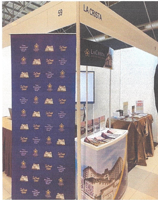
Figure 3: In charge of booth at MITC Ayer Keroh