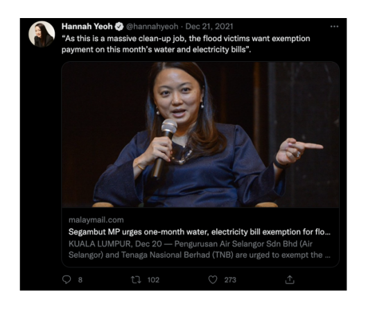
Figure 3: Hannah Yeoh [P2] at a press conference

The post was meant to convince the public that she was aware of what was needed on the ground where the victims were suffering and in dire need of assistance especially from the government. Thus, the post was a way of convincing the public that she was on their side and that she was in parliament as their representative.