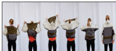
Figure 2. Weather wear jacket design by Knoblauch in 2022

The first design sketch started with a reference made from a jacket design by Knoblauch in 2022 (Figure 2). It was determined from the study that every human will naturally reach out both of their hands to cover their head during rainfall and to shelter from heat or cold.