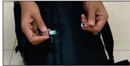
Figure 5. Detachable safety whistle

Following that, used umbrellas from different colours and size were collected from friends and families. The seams of the used umbrella were carefully removed, followed by transferring the sewing pattern onto the fabric. In an effort to make use of every part of the umbrella, a hiking stick from the umbrella's rod was included in the design for the hiking stick. Afterward, the fabric is cut to size for the whistle holder, GPS pocket and the poncho. The cut-up fabric was then meticulously sewn together using a home sewing machine and cotton threads (Figure 6). With a few more testing and improvements to the product, Smart backpack was born (Figure 7).