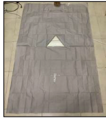
Figure 3. A life sized replica made from mahjong papers and Sellotape.

A miniature replica was created from an A5 notebook paper. Then, the design transferred to a real-life scale on mahjong papers and sellotape, then changes were made due to some technical issues (Figure 3).