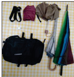
Figure 1: Items and materials use for the innovation of Eco Smart Backpack