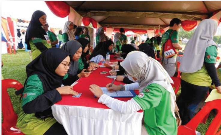
Picture 2: The registration processes