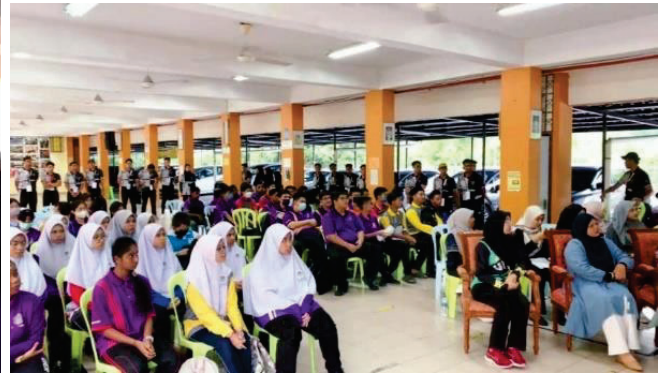
Picture 1 and 2: Activities during the event