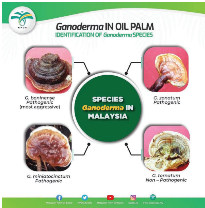
Figure 2: Ganoderma in oil palm.