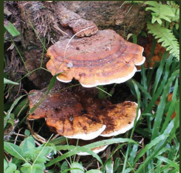
Figure 1: G. boninense that was found in the basal area of the oil palm tree