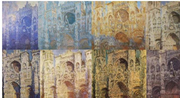
Figure 3 Rouen Cathedral series

Monet started his Rouen Cathedral series in February 1892, following the classic works of the Haystack series in 1888 and the Poplar series in June 1891. Rouen Cathedral, located in the city of Rouen in Normandy, France, is a medieval Gothic masterpiece that has stood for centuries as a symbol of religious piety and architectural brilliance. During a visit to Rouen in 1892, Monet was fascinated by the interaction of light on the facade of the church building, which inspired him to create more than 30 paintings.