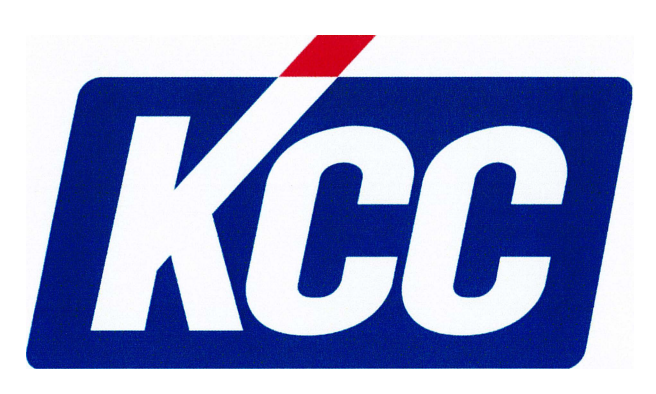
Figure 1: KCC Paint Sdn Bhd Logo

Korea Chemical Company aka KCC started out as Kaumkang State Industries Ltd in 1958. For over half a century KCC has been playing a leading role in technological innovation in building materials such as glass, windows, doors, exterior and interior materials and flooring. Then, KCC moved into silicone business, an area ripe for the creation of high value products in the fields of specialized paints and next generation precision chemical engineering. Nowadays, KCC has been one of the largest chemical company in Korea and expand their business in Malaysia.