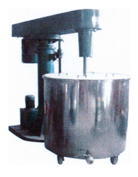
Figure 5: Mixer

After production receive the work ticket, paint maker will start to produce the product. First step of the process is grinding. Grinding is mixing the powder materials in mixer. Grinding process take a few minutes. Then, after grinding process finish, paint maker will give sample to Quality Control (QC) department for dispersion checking process. Dispersion process is to check if there any particle in the sample. For solvent-based paint, the sample will mix with a solvent according to work ticket. One of the solvent use is xylene. For water-based paint, the sample will mix with water if the sample too thick. If there any particle during dispersion checking process, the product will be stirred for few minutes. If dispersion process is passed, paint maker continue to next process which is mix with other materials such as solvent or water. When the process of making the product finish, QC will take sample for checking the specs required in work ticket such as viscosity, pH, specific gravity and color. If there any problem with the specs such as viscosity too high, QC will make adjustment based on previous record. If no previous record, QC will refer to R&D about the problem. When all the specs required passed, QC will give to packing department for packing the product.