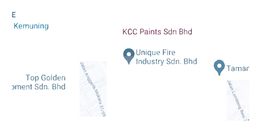
Figure 3: KCC Paint Sdn Bhd

Every student at Universiti Teknologi MARA (UiTM) need to seek for companies for their industrial training in order to complete the Diploma in Chemical Engineering. Due to the Covid-19 pandemic, it is really hard to find a placement. Many factory are not open internship placement. However, KCC Paint still open the chance for industrial training but they're not taking many students. Below shows the location of KCC Paint Sdn Bhd which is located at No 1, Jalan Anggerik Mokara 31/55, Seksyen 31, Kota Kemuning, Shah Alam, Selangor.