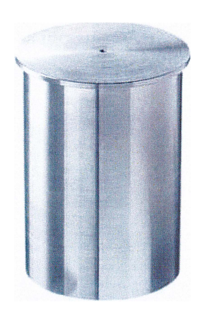
Figure 9: Specific Gravity cup for checking specific gravity