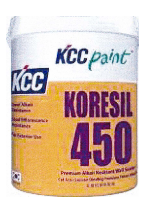
Figure 6: One of the KCC Paint product

After received the work ticket, packing worker will prepare the cans or drums to pour the product. The will be filtered before poured into the cans or drums. This step really important to avoid any unwanted particle in the product. Then, the cans or drums will be labelled and packed according to their batch before move to warehouse. If the product need to delivered to customer on the same day, the product will loaded to lorry after finish packing.