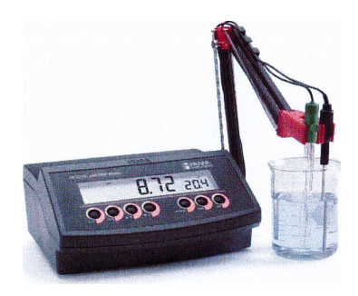
Figure 10: pH Meter for checking pH