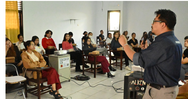
Art talk and sharing session at Universitas PGRI Mahadewa Indonesia UPMI