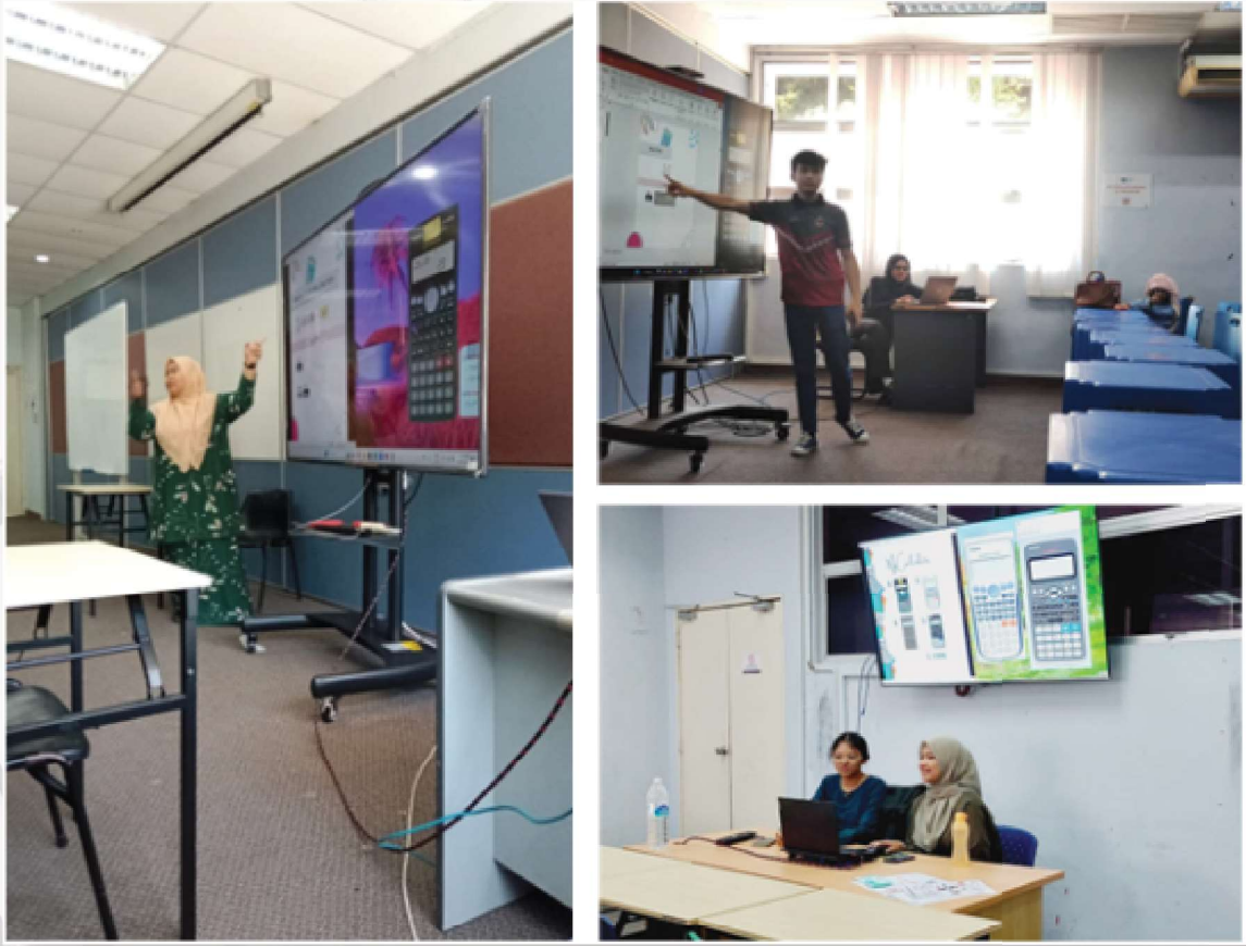
Figure 2: Facilitators demonstrating how to use a scientific calculator to students