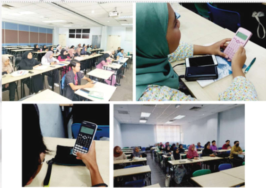
Figure 2: The participation of attendees in the Smart Calculator 2.0 program.