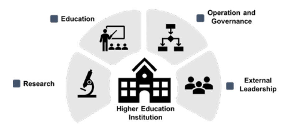
Step 2: Extraction and Classification of SDG indicators from the Local and International Guidelines outlining indicators for the four main functions identified in Step 1

This step extracted and classified seven (7) guidelines that provide whole and partial SDG indicators. The SDG indicators were analysed based on the four main functions of HEIs from Step 1. Table 1 shows the basis of the analysis of the indicators. The assessments on the SDG indicators from the guidelines identified a total of 1068 indicators that are dominated by the SDSN 2021, followed by the Times Higher Education (THE) Impact ranking 2021.