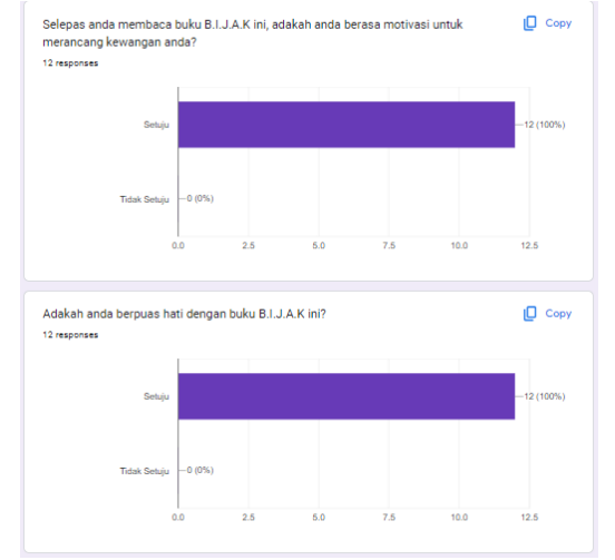
Feedback for "B.I.J.AK V.1" 2