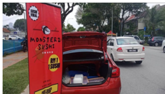
Figure 2.3 How they pack their sushi and how Monsterz Sushi agents make a sale