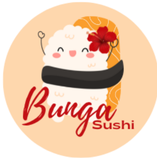
Bunga Sushi Logo