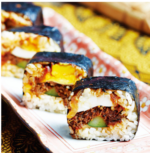
Nasi Lemak Sushi