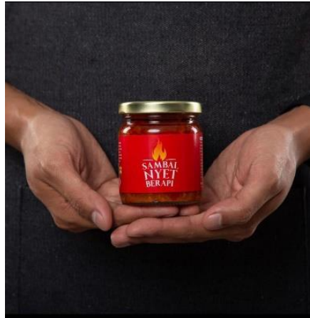
Figure 1: Sambal Nyet Berapi

Sambal Nyet Berapi is one of the newly formed ready-to-eat food products in Malaysia's food business. Khairul Aming, a well-known businessman and social media influencer from Malaysia, started it. Sambal Nyet is a dipping sauce or chilli paste that goes well with a variety of Malaysian dishes, including fried chicken (known as ayam gepuk in Malaysia), Fried Rice, Nasi Lemak, and many others. This product that was created and managed by Khairul Aming can last up to five months.