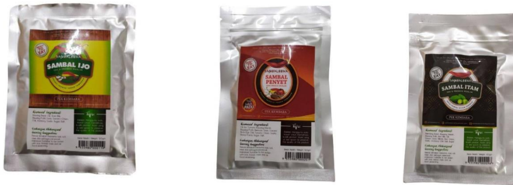
Figure 3: Sambal Hijau, Sambal Penyet and Sambal Hitam by FRASH Enterprise.

In January 2023, we decided to come out with our own company named FRASH Enterprise. We planned to produce a dipping sauce that goes well with variety of foods named SAMBALEENA by FRASH Enterprise. It comes with different flavours that suits everyone's taste. Ready-to-eat food is easy to bring anywhere you go especially for students and travellers. We will make sure that our dipping sauce can add some spiciness into consumers' dishes.