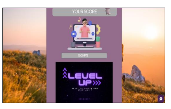
Figure 4. Score & Video