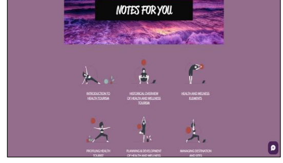
Figure 2. Notes Section