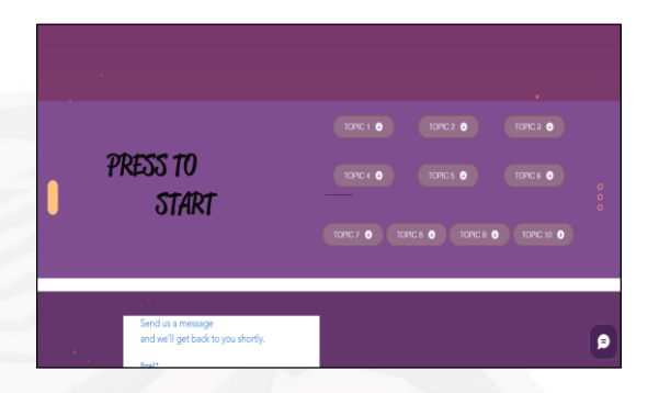
Figure 3. Quizzes Section