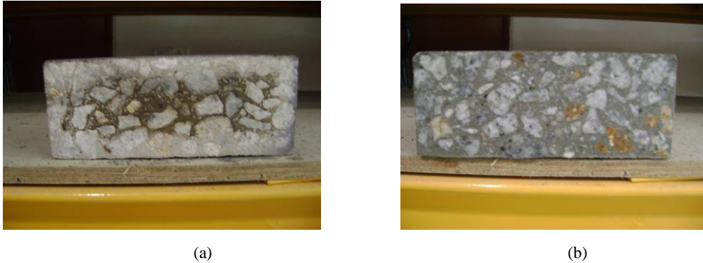
Figure 2 Specimen with NA at 0.58 w/c ratio immersed in 1M NaCl Solution after 28 days (a) before spraying with \text{AgNO}_3 (b) after spraying with \text{AgNO}_3 .

covered with plastic sheets and stored at room temperature for 1 day, then moved to a standard curing room with a temperature of 20 \pm 2^\circ\text{C} and relative humidity of greater than 95%.