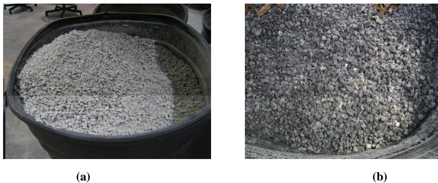
Figure 1 Aggregates; (a) Natural aggregate, (b) SS aggregate

A nominal mix ratio of 1:2:4 (Cement: Fine Aggregate: Coarse Aggregate) was adopted for the purpose of this work. Table 1 provides mix proportion of the SS series in which binder composition is invariable and water to binder ratio 0.58, 0.64 and 0.70 were used. The mix composition was computed using the absolute volume method and the batch compositions are shown in Table 1. Single tests were performed on the control specimen without SS to avoid the effect of coarse aggregate on concrete behaviour. In an attempt to optimize SS content with respect to the behaviour, the coarse aggregate was partially replaced in concrete at four replacement levels (0%, 10%, 50%, 100% by volume of coarse aggregate). It should be noted that the w/c ratio dosage of SS was initially designed to be invariable for these mixes. However, as the SS replacement level increases, a satisfied fluidity (slump >100 mm) of the fresh mixture was needed to realize the good dispersion of coarse aggregate and good homogeneity of a matrix. The preferred formulation was further fixed to investigate the effect of w/c ratio and SS dosage.