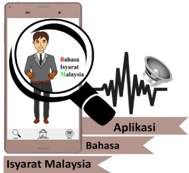
Figure 2: Mobile device

A study by Samsudin (2019) shows that mobile devices also affect student achievement. As the policy presented by the Ministry of Education Malaysia (MOE) which states that information and communication technology (ICT) is a requirement that needs to be integrated in teaching and learning. Such requirements include mobile devices such as computers, laptops, smartphones and so on. However, some of these devices are still in the research stage for formal use. This clearly shows that mobile devices are necessary in teaching and learning because their functions and uses are significant as a tool that gives access to information more quickly.