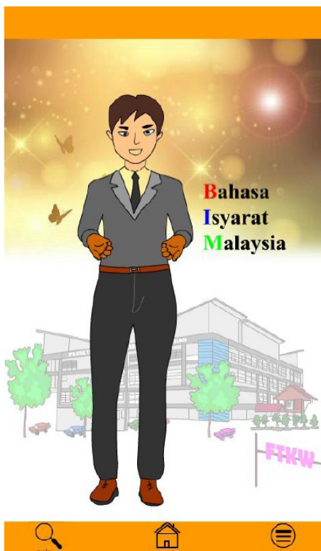
Figure 1: Interface Application for Malaysian Sign Language (ABIM)

Based on the findings of a study by Samsudin (2019) Malaysian Sign Language Application (ABIM) makes it easier for students to understand what is learned because the module design incorporates animated elements and there are examples of the use of sentences in easy to understand language. In addition, through this method, students can identify their own weaknesses and based on the existing weaknesses, students need to emphasize on those. Learning modules that apply multimedia elements such as animation make it easy for students to imitate hand gestures, such a learning method as through real experience.