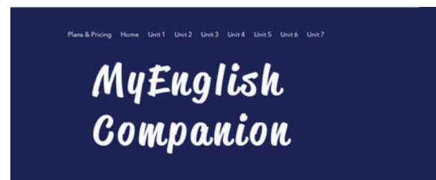
Figure 1.1 The Website Header of MyEC

MyEC is supported by multiple content types – text, audio, images, video, and animation. These resources offer a range of benefits, such as flexibility, individualization, and accessibility. The content of MyEC can be accessed from anywhere with an internet connection, allowing learners to practice and improve their language skills at their own pace and convenience. Learners can subscribe to this learning portal at a mere payment of RM10, giving them access to the content for four months.