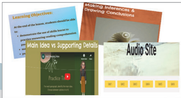
Figure 1.3 Sample of learning contents in MyEC

The content of each learning unit in MyEC is arranged into 4 different sections namely reading, grammar, listening, and speaking. This feature can help learners focus on topics and areas they struggle with the most, leading to a more efficient learning experience.