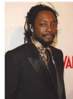
Will.i.am (Black Eyed Peas)

Kutcher has backed Code.org and Hour of Code, initiatives that aim to help children learn to code. Kutcher is also known as an astute tech investor.