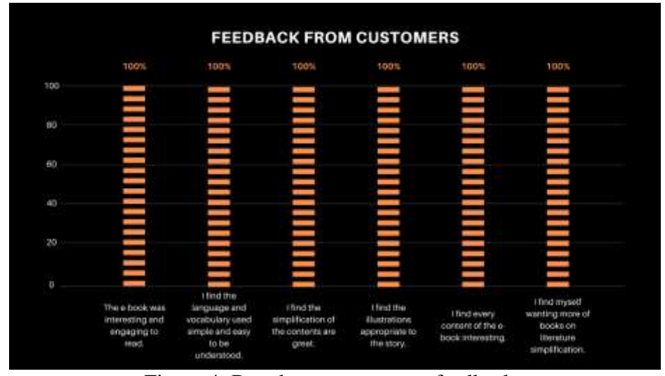
Figure 4: Bar chart on customer feedback.

Then, the author sent out a feedback form a few days after the e-book was purchased to have a better understanding of what the buyers thought of the book. There were 13 people who responded to the survey.