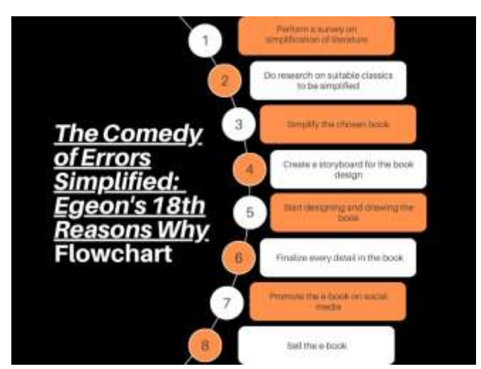
Figure 1: The Comedy of Errors Simplified: Egeon's 18th Reasons Why flowchart.

The goal of The Comedy of Errors Simplified: Egeon's 18th Reasons Why is to write a book that will be able to summarize numerous outstanding literary works for a larger audience. As a result, many more people will be able to enjoy reading a variety of classics without needing a deep understanding of literature, which is essential because reading classical literature can be more challenging than reading modern books. When considered in context, the words and imagery utilized differ greatly from those of modern times. A questionnaire was distributed before the author began constructing the project to help choose the key elements to focus on in the book. The Results and Discussion portion of this paper contains a discussion of the findings. The flowchart below was used to create the e-book and the general procedure used.