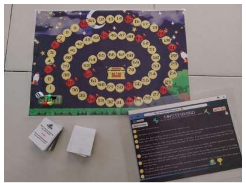
Figure 1: The completed board game