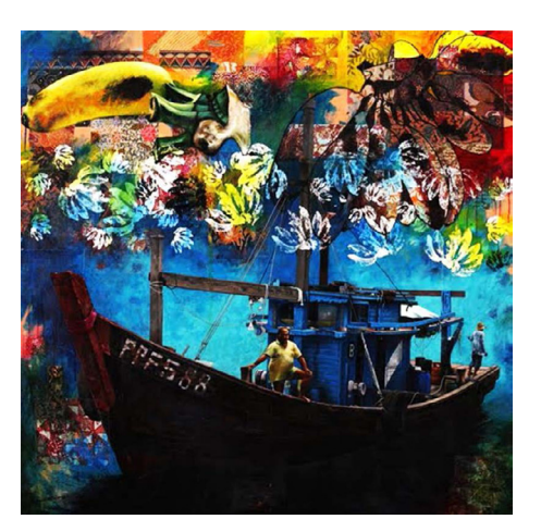
Figure 4: Pisang Emas dibawa Belayar by Zaim Darulaman 167.5 cm x 167.5 cm, Mixed Media on canvas, 2010

This painting shows the image of a boat, two human figures and bunches of bananas. The composition of the painting is symmetrical balance as the boat is in the centre at the bottom of the painting. The weight of bananas also balances between left and right. The artist uses repetition of bananas using print techniques with overlapping white silhouette which create texture. He uses primary colour, dominated by blue and black with some yellow, red and green. The yellow colour in this painting gives contrast. The image of boat which applied the value of colour give the visual of forms. There are vertical and horizontal lines in the boat image. The artist emphasizes a banana by making it in big size compare to the other image of bananas.