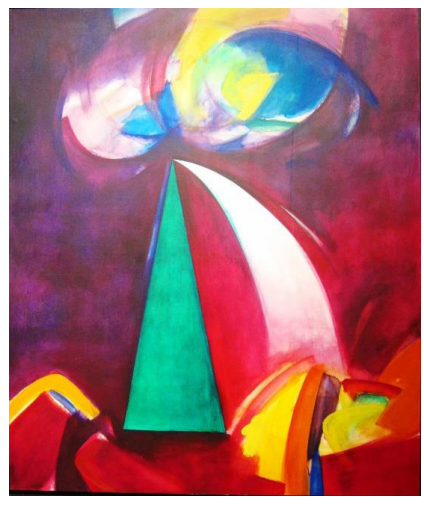
Figure 2: Sidang Roh by Syed Ahmad Jamal 198 cm x 168 cm, Acrylic on canvas, 1970

She successfully portrays the painting in a decent way of formalism. She used semi abstract style of painting and successfully carried the meaning of the poem.