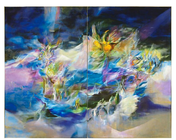
Figure 3: Kelahiran Inderaputra by Anuar Rashid 244 cm x 306 cm, Oil on canvas, 1978

Roh by Kassim Ahmad (1960). The abstract images are vibrant and dynamic, reflecting the effort of the artist to convey the message of the poem. He successfully applies the formalism that emphasizes all the elements and principles of art.