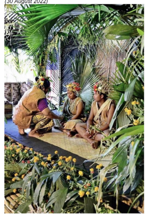
Figure 2: Orang Asli ceremony decoration