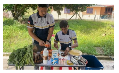
Fourth, in this photo, we show you the process of cutting rotten fruits and fish. This process needs to be done because we need to make sure the rotten vegetable and fish will be easier to decay more.