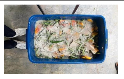
Lastly, we combine all of the items and materials in a container and this is the final look of our organic foliar.