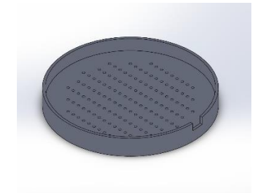
Figure 1: Galvanized steel sifter