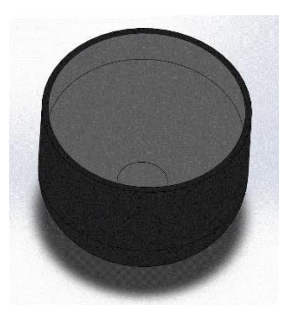
Figure 2: Plastic cup sprayed with Nano coating