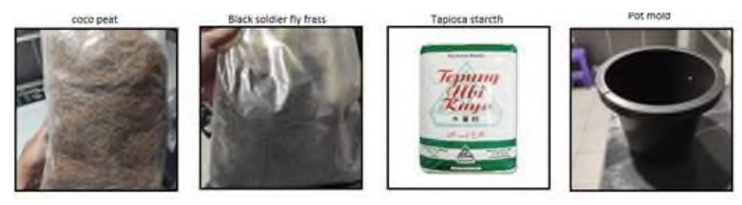
Figure 1: Materials Need to Make The Organic Pot

Coco peat is available at a nearby convenience store. The amount of coco peat used to produce this pot is 200g. (BSFF) is available on the online purchase platform that is shopee. According to previous studies, the amount (BSFF) used is as much as 23.3g because it gives the best results. For tapioca starch, it will be used as a binder or glue to hold all the ingredients in the pot. The amount of tapioca starch that will be used is 100g. A pot with a diameter of 15 cm and a height of 10 cm is used as a pot mold.