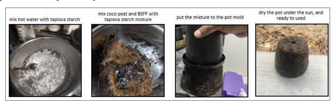
Figure 2: Process Making the Pot RESULT AND DISCUSSION

Weigh all the ingredients according to the measurement first. Put the tapioca starch into the container and mix it together with 50ml of hot water. Stir the tapioca starch mixture until it becomes clear in colour and becomes viscous. Next, add the coco peat and mix until combined and leave for 5 minutes to cool the mixture. Then add BSFF with the mixture and mix well. Prepare the pot mold for the printing process, the mixture will be put into the mold, flattened according to the pot mold and left in the mold for 12 hours. After 12 hours remove the printed mixture and dry it in the sun for 12 hours. Finally, the packing process is done, the uneven coco peat will be packed, and the pot is ready to use.