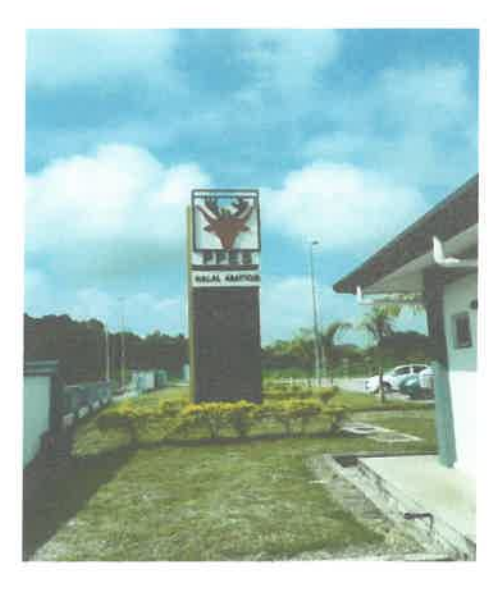
Figure 2.4 Entrance of Halal Abattoir Complex