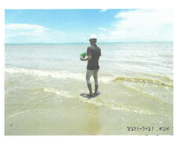
Figure 2.3 Process of Sampling at W1 for EMR Kuala Baram