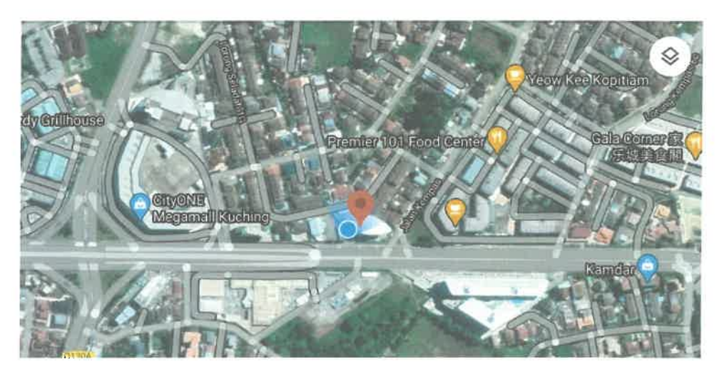
Figure 1.2 Location of PERUNDING NAJNA

Level 4, RCW Corporate, Lot 12292-3-2, Jalan Tun Jugah, 93350, Kuching, Sarawak