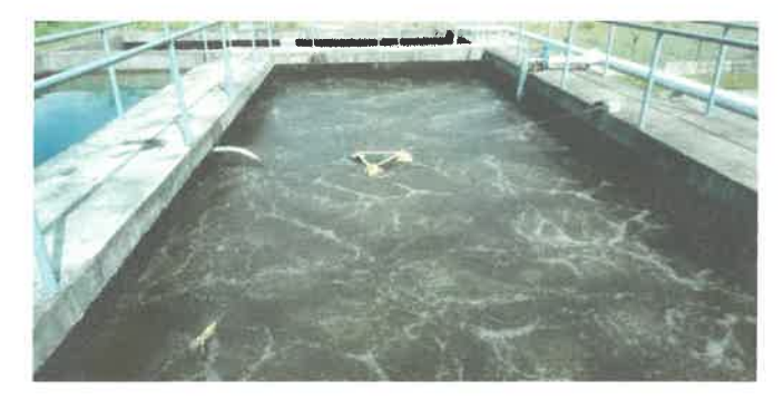
Figure 2.5 Aeration Tank of the Wastewater Treatment System at Halal Abattoir Complex