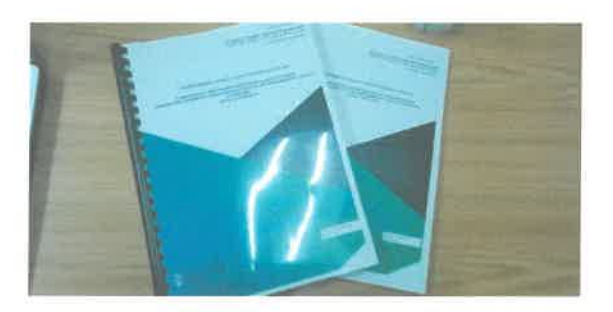
Figure 2.1 Front Cover of Written Notification

Activities conducted included assist in the calculation involving generator set, boiler/burner, cyclone, bag filter as well as water treatment system. Besides that, find the related journals or articles and catalogues or technical specification sheet to support or conduct the calculation.