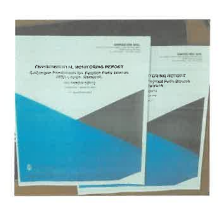
Figure 2.2 Front Cover of Environmental MonitoringReport