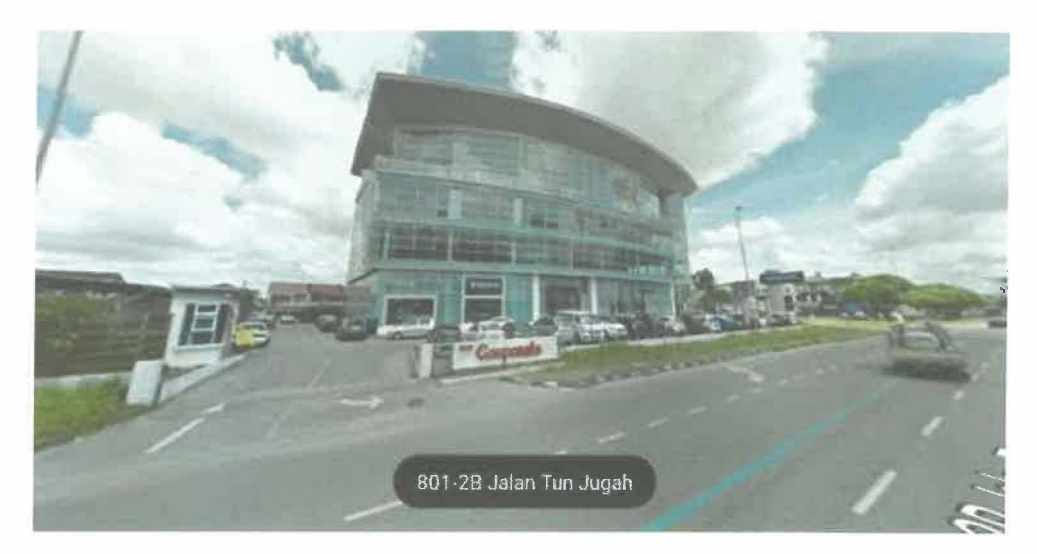
Figure 1.3 PERUNDING NAJNA SDN BHD's Office at RCW Corporate