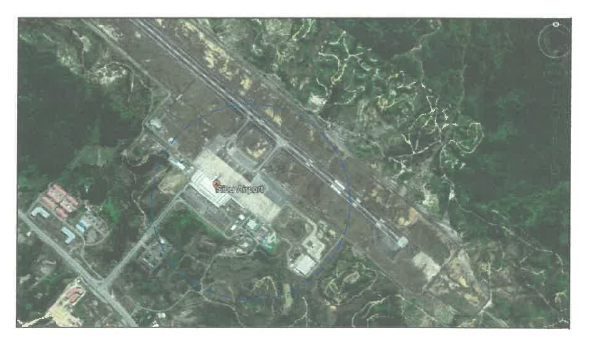
Figure 3.1 Locality Plan of the Project

The project is covering the area of Sibu, Sarawak. The specific location is located at Sibu Airport, 96000, Sibu Sarawak. There is no public facilities in the area within 150 m radius from the location.