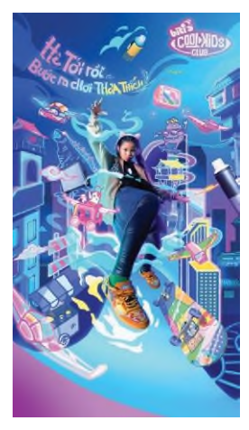
Figure 3. Ideation concept of photo manipulation and illustration for print ads

After the brainstorming of ideation concepts, I have to sketch the suitable idea for this campaign's print ads. This will minimize any frustration throughout the creative process. I have chosen to use the figure of a