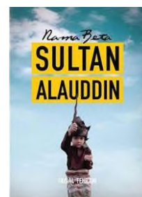
Figure 1. Cover Book of Nama Beta Sultan Alauddin