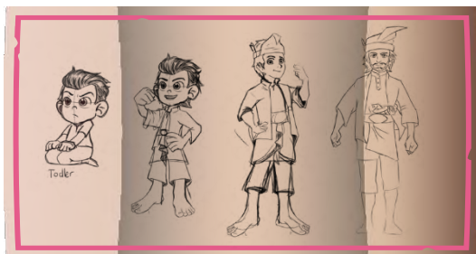
Figure 3. author's personal collection (Rough Sketches of Sultan Alauddin Riayat Shah)

A visual representation of information or ideas, usually in the form of an image, is referred to as an illustration. Photographs, paintings, drawings, and graphs are a few illustrations. The personal styles of new artists have developed and expanded over the period of illustrated history. Due to lack study sources, creating this character face and physical is difficult but using resources about how our Malay culture and sultan dressing code can overcome this problem. Also with consultation and advise from my supervisor, to create Sultan Alauddin Riayat Shah and support character can be done. The artstyle of this illustration book need to be cute due to age of target audience.