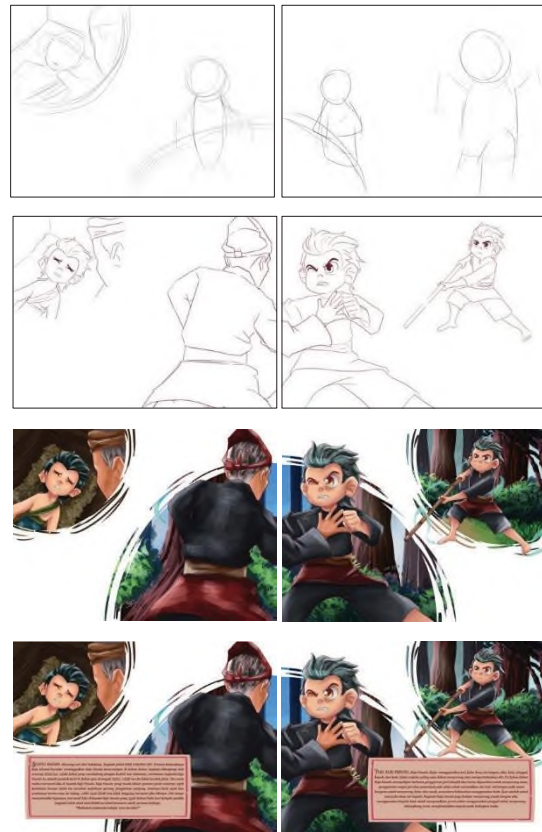
Figure 7. author's personal collection(step-by-step pages drawing)