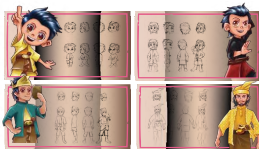
Figure 5.

It's not easy to maintain character art direction each page so the character need to have some special characteristic. For Sultan Alauddin Riayat Shah, his special characteristic is on hand and ear which is big than other character. The skin color is medium dark, his eyes is big and his hair is a little wavy due to Malay characteristic. And to maintain the art direction of this character, character turn around is a must.