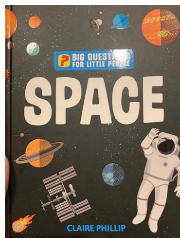
Figure 1. Space children book cover page

This study deals with the problems encountered in the use of external structure, internal structure, typography, and illustration elements in storybooks published for children that form the study sample and are analyzed based on the established criteria. In this qualitative study, a literature review and study area were conducted. Techniques used in children's storybooks are evaluated.