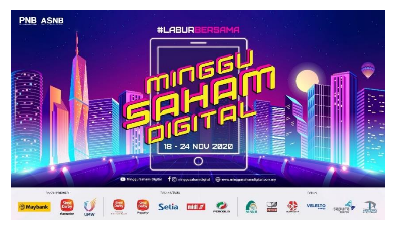
Figure 20: Minggu Saham Digital Banner

Other than that, in promoting their products, ASNB also held seminar and they even have their 'Minggu Saham Amanah Malaysia (MSAM)' where they promote all their products. As for last year, ASNB held 'Minggu Saham Digital (MSD)' as the substitute for 'Minggu Saham Amanah (MSAM) as we are facing the pandemic. There are numerous interesting activities organized by ASNB such as forum, webinar on the investment and financial education and they even have virtual concert to attract people to join the Minggu Saham Digital (MSD). There was also various competition held and they reward the best prizes to the participants. (Khalib, 2020)