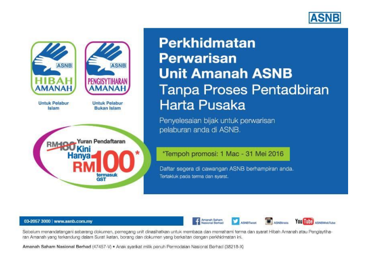
Figure 19: ASNB website prootion

staff wants to explain about the terms and condition, most of them said that they already know about it as they already read the promotions through the pamphlets that they received. Besides, ASNB also actively promotes their product through their online channel such as Facebook, Twitter and they also have their own websites which anyone can easily find all information through this website.