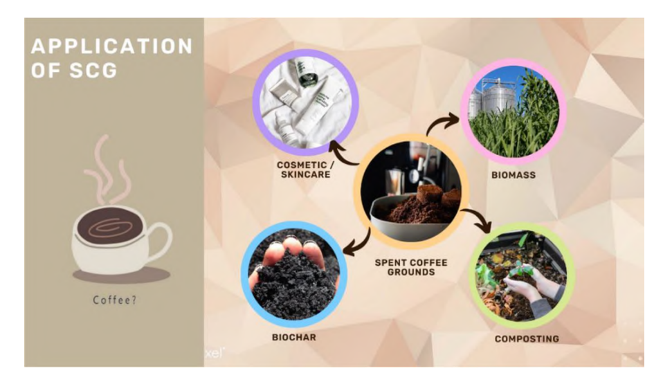
Figure 2 Application of Spent Coffee Grounds