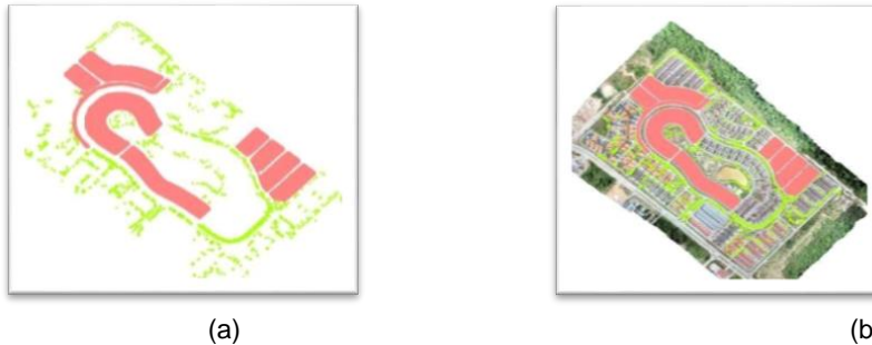
(a) (b) Figure 5: The Location of Tree Crown Planted and non-Planted (a) without Orthophoto (b) with Orthophoto

This is, according to the guideline provided by the National Landscape Department, where a single tree crown should cover for every two houses units. Besides that, the tree planting distance should be at the range of 30 ft to 40 ft. As shown in Figure 5, the pink color represents the non-planted areas, while the green color represents the existing tree crown planted. So, it shows that many areas are still left and not fulfilled with the tree canopy to make greener areas. In addition to that, the existing tree crowns along the road mostly the sparse crown which do not fulfill the distance as implied.