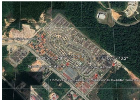
Figure 1: Study area located at Puncak Iskandar, Seri Iskandar, Perak

The study area comprises the residential neighborhood of Puncak Iskandar, Perak with an area of 61.523 hectare which is located at latitude 4^{\circ} 22' 26.4''N and longitude 100^{\circ} 57' 30.24''E (Figure 1). Puncak Iskandar is among the attractive residential neighbourhoods in Seri Iskandar, due to its modern layout and housing design and multiple types of residential to cater to the population needs. The following is the discussions on the methodology process, which is organized into three stages, namely, data acquisition, data processing and results.