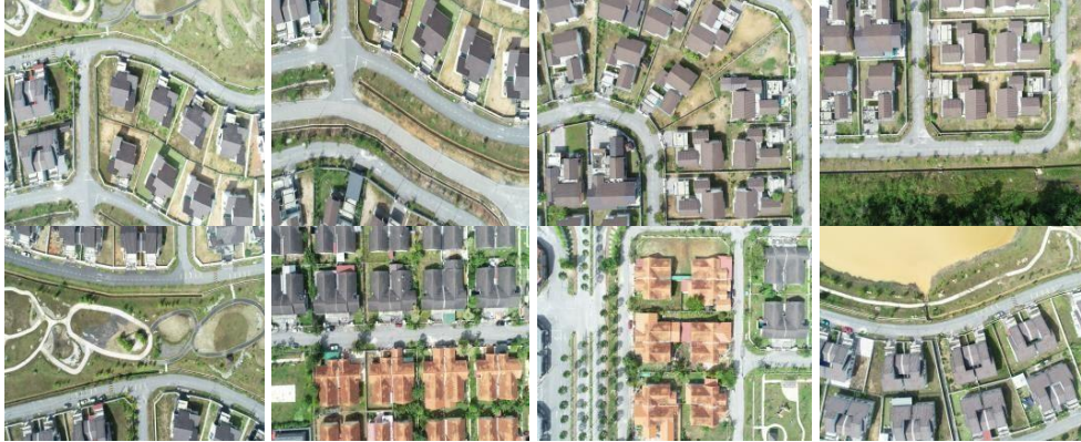
Figure 2: Images derived from UAV at 150 meter flying altitude